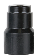
2" Screw-On Bull Head