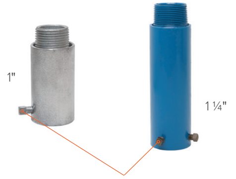
5/16" hardened, square head, cup point set screws for extra holding power and adjustability

Our service box extensions are made from Schedule 40 pipe and are used to increase the height of an existing service box or to accommodate greater depth in a new installation. The service box extension is installed by removing the existing cover and sliding the extension over the top of the box pipe. The extension is adjusted to the desired height and the set screw(s) are tightened to lock it in place before replacing the cover. Extensions are made in lengths from 3" to 24".